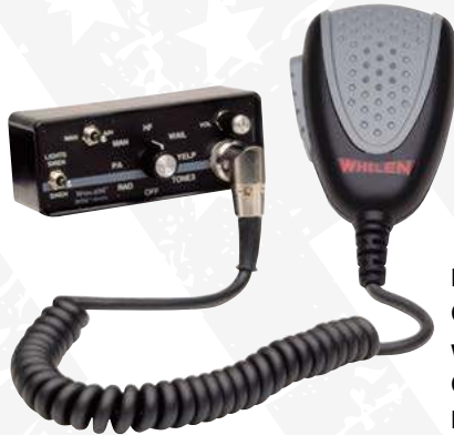
BETA1 Control Head with Noise Canceling Microphone